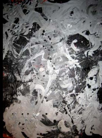
Winter Abstracts in Black, Whites, and Grays